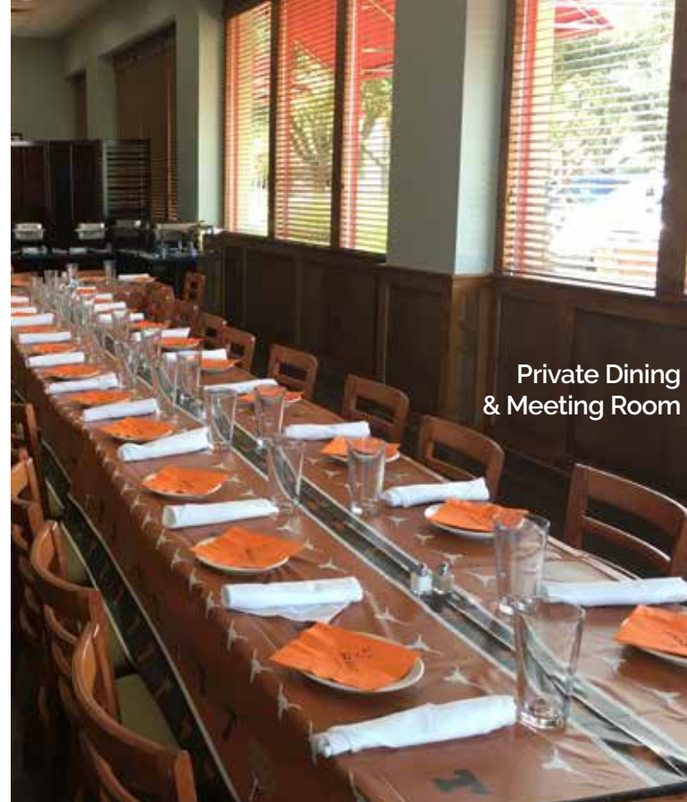
Private Dining & Meeting Room